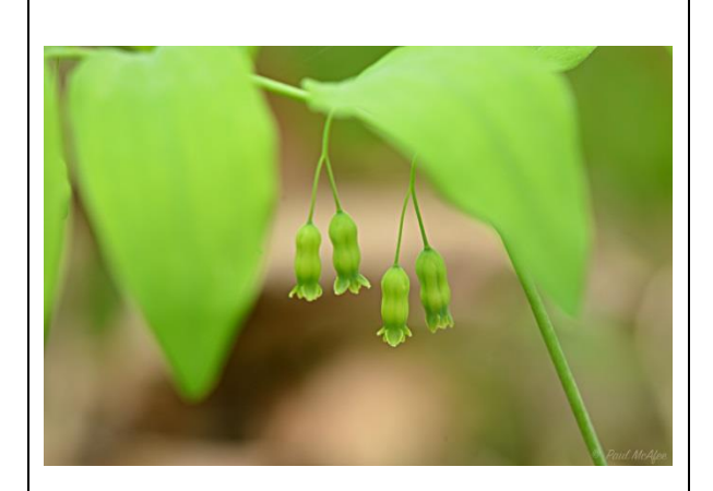
Flowers hang below each leaf, generally only one or two per leaf.