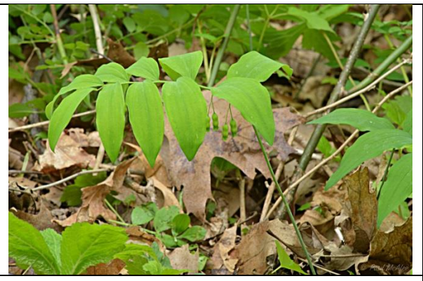
This plant is smaller and blooms earlier than Smooth Solomon's Seal.