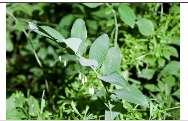
This very common plant can be quite variable in size, some plants being over four feet tall.