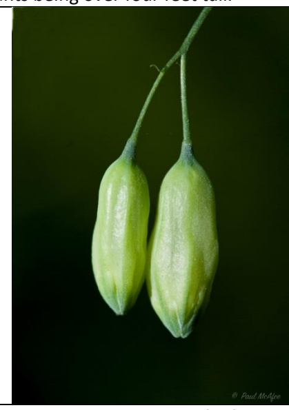
Flowers also hang below each leaf, often have more than two per leaf.